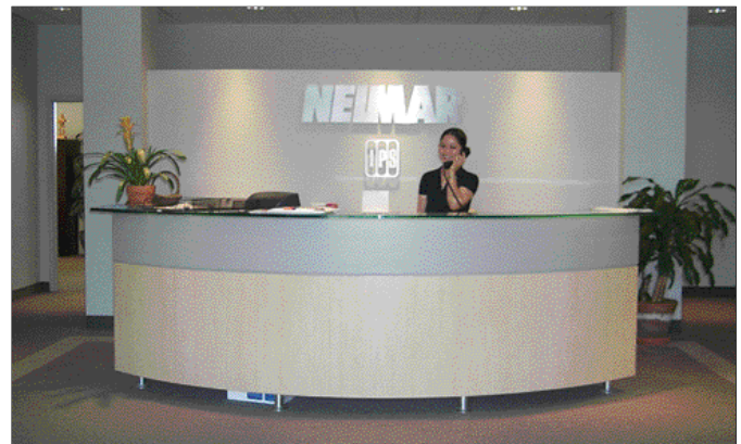
Nelmar provides security packaging systems to almost any type of business worldwide.

Their tamper-evident security packaging systems can be used for any types of businesses where cash is involved. For examples; proper cash handling at sports venues can be a very serious issue, as most - if not all - of the revenue derived from an event's gate receipts and kiosk sales is transported by a third-party carrier. The transfer of funds does not normally take place directly between the depositor (kiosk) and the bank. Generally, the cash deposits